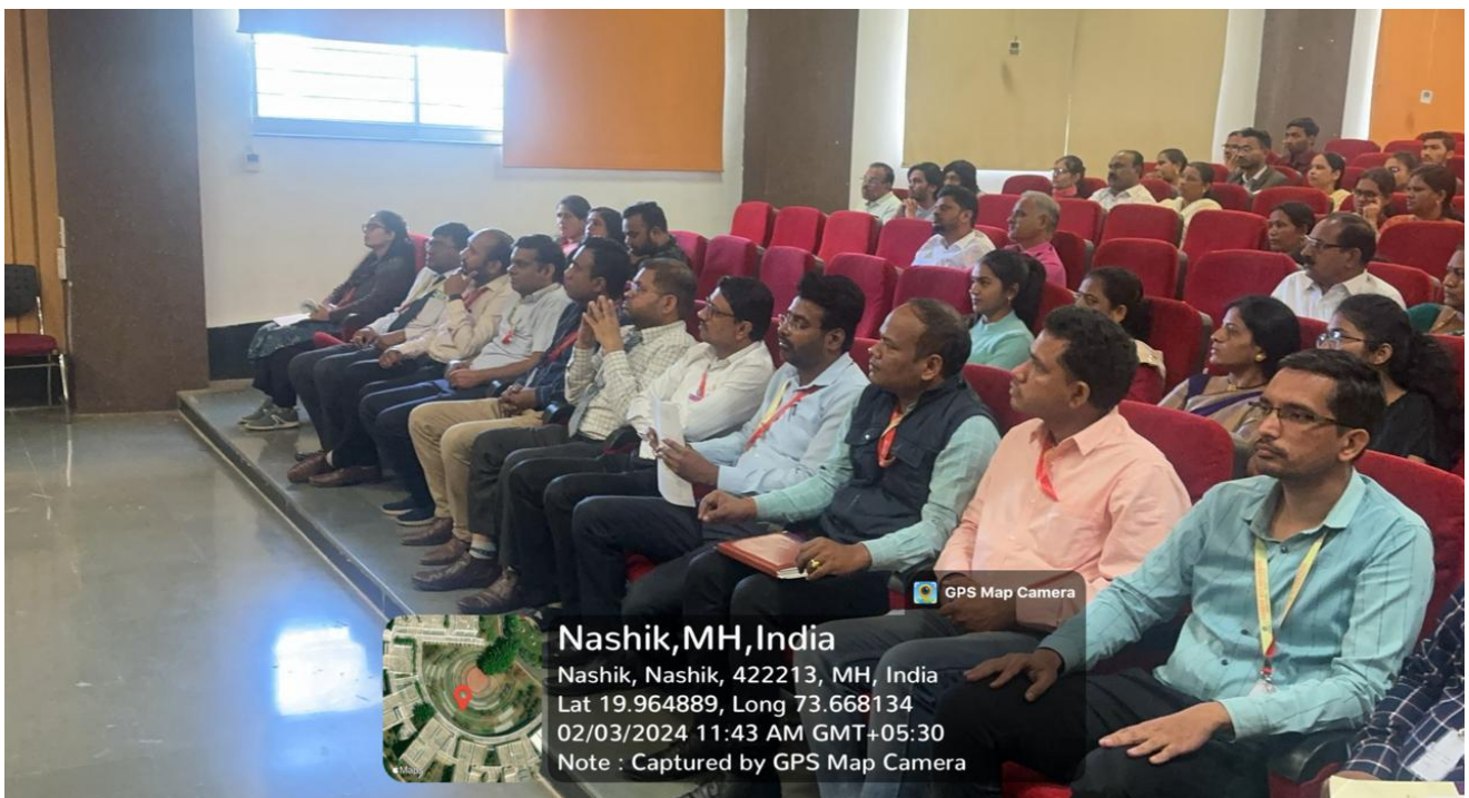
Photo: Program attended by Students, Staff and Parents.