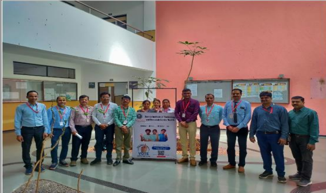
Faculty Click Selfie on the Occasion of National Voter's Day