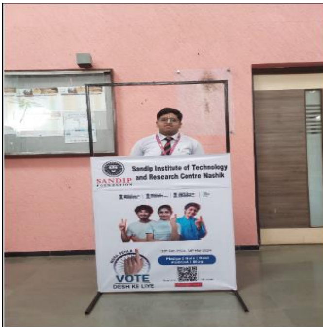
Student Click Selfie on the Occasion of National Voter's Day