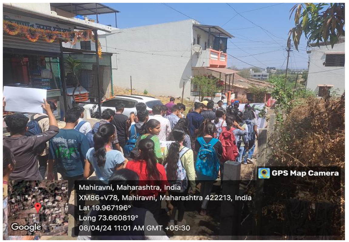
Students participated in the voter awareness rally