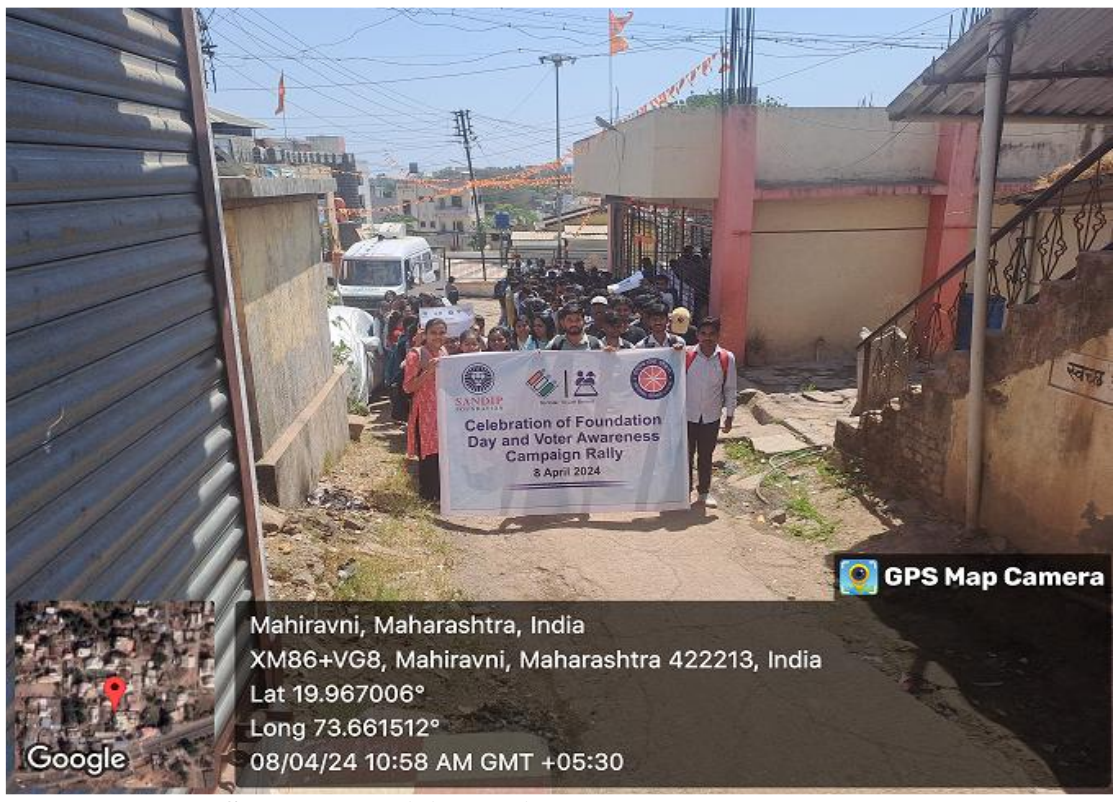
Students participated in the voter awareness rally