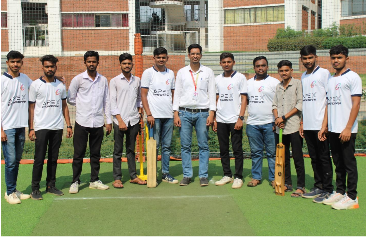
Photo: Box Cricket Competition