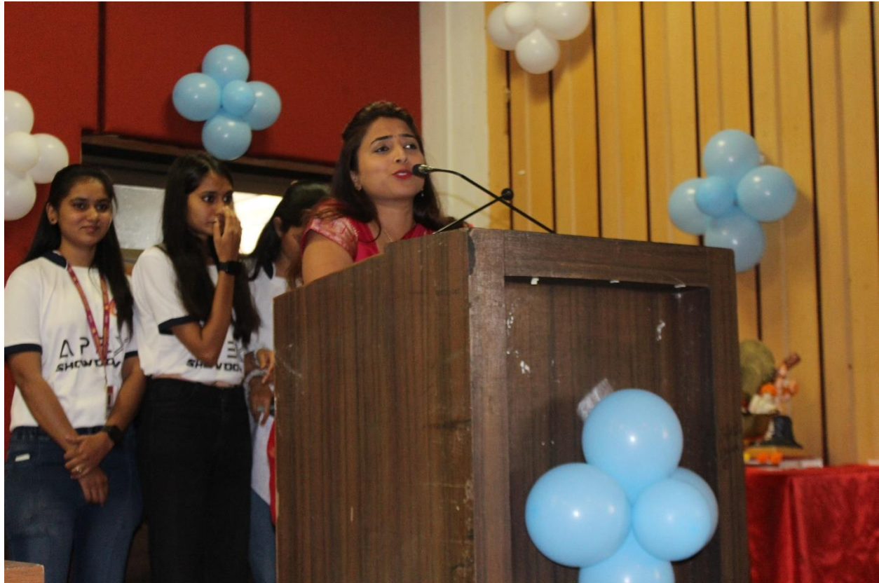
Photo: Welcome speech and Event overview given by HOD