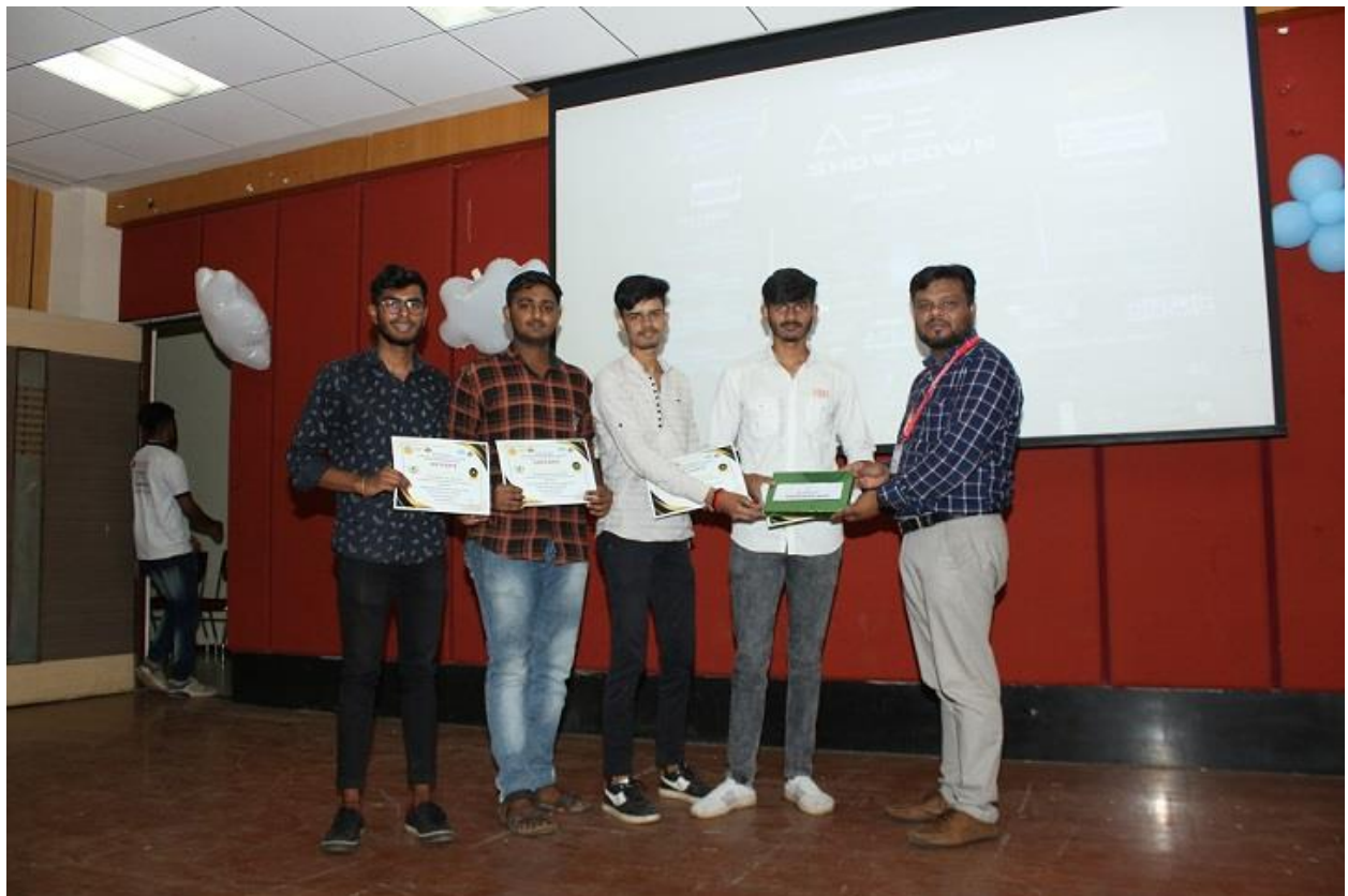
Photo: Prize Distribution