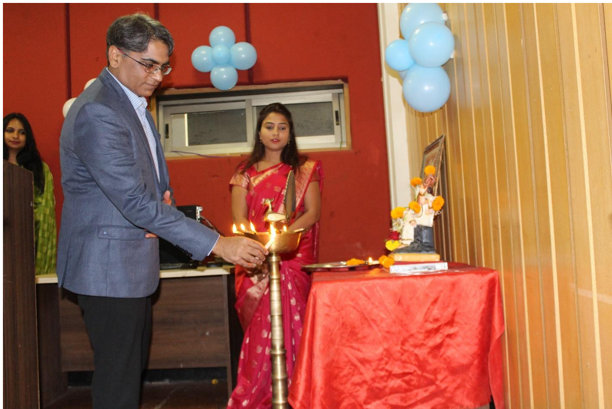
Photo: Saraswati Pujan by Guest.