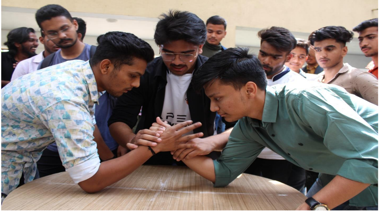
Photo: Arm wrestling