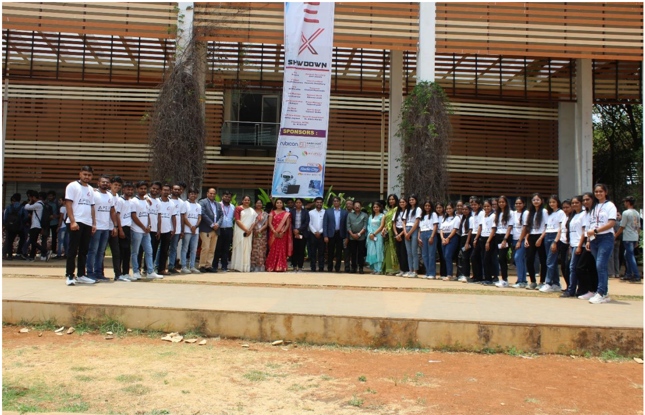
Photo: Inauguration of APEX Event