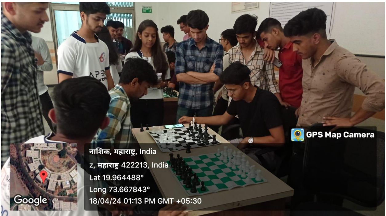
Photo: Chess Competition