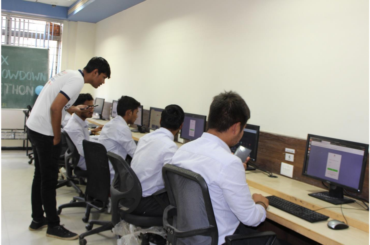
Photo: Coding competition