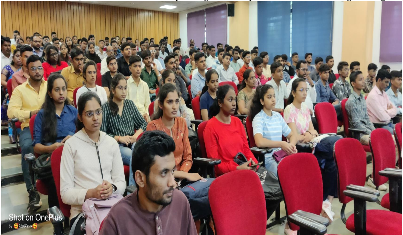
Beneficiary Students of F.Y.B.Tech