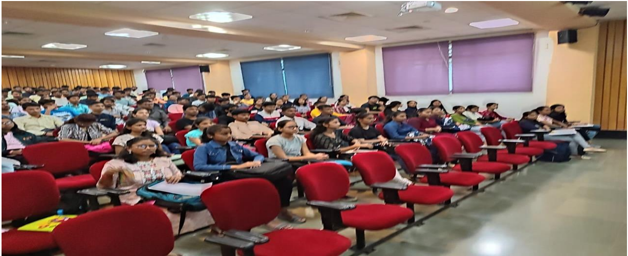
Beneficiary Students of FY B.Tech