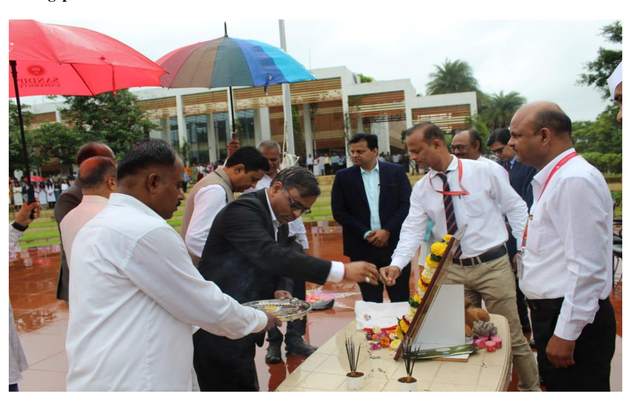
Inaugurataion Of Independence day