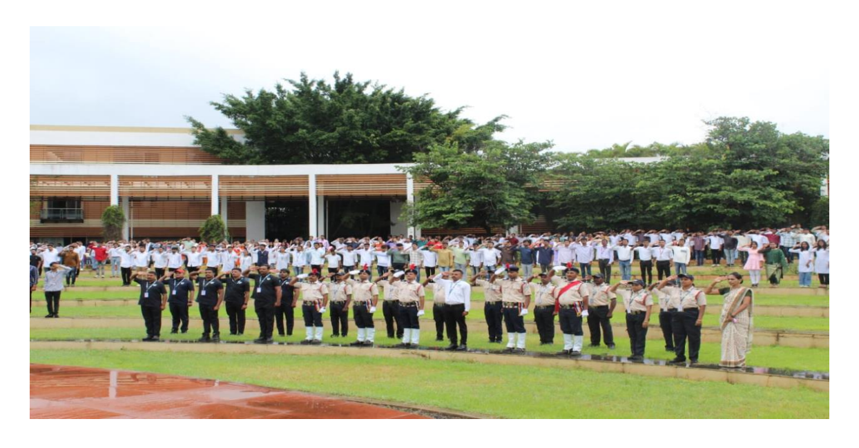
"Pledge of Allegiance"