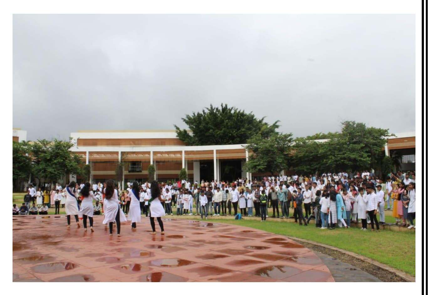
Cultural Performance by Students