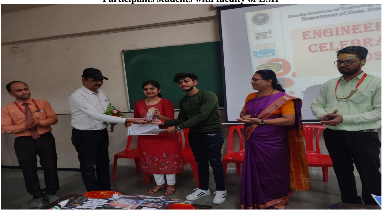
Felicitation of Winner by HOD of ESH

Participants students with faculty of ESH