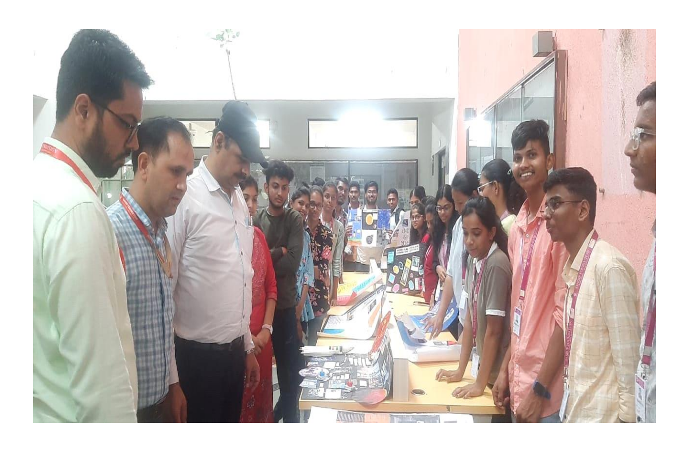
Evaluation of Poster by HOD of ESH and Judges