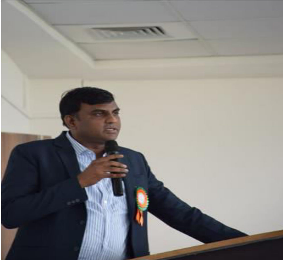
Speaker addressing to students for IPR-laws and treaties