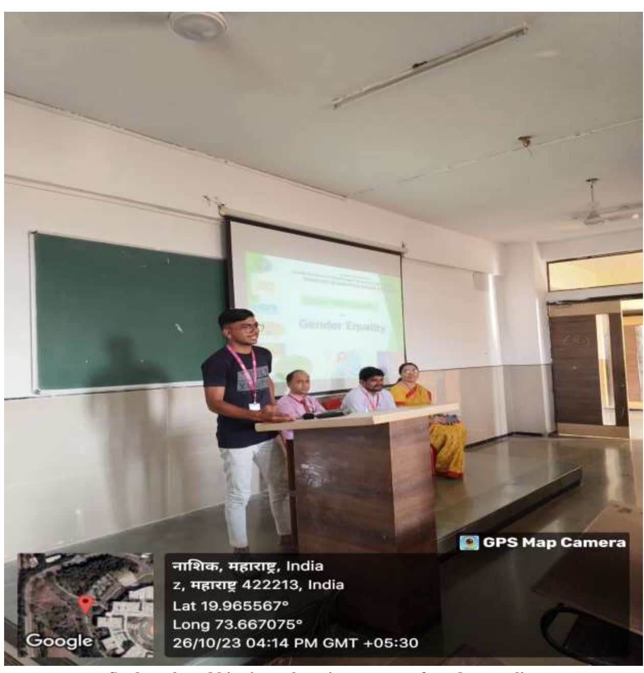
Student shared his views about importance of gender equality