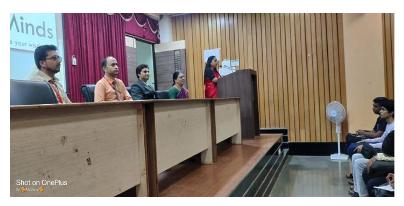
Introduction of Guest Speaker