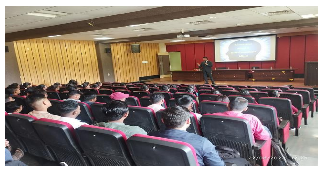
Beneficiary students of F.Y.B.Tech.