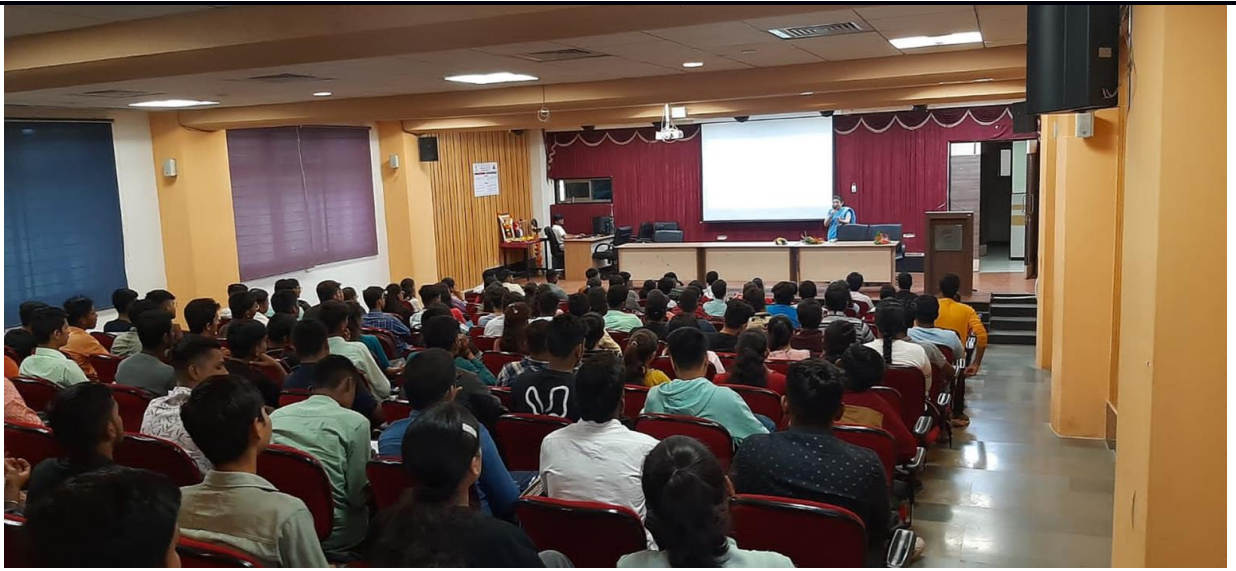
Beneficiary Students of FY B.Tech