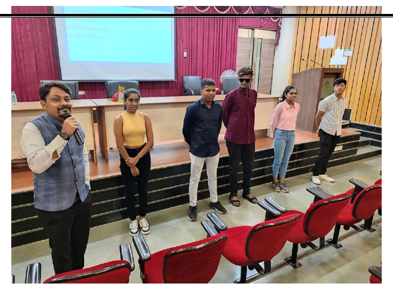
Students Participated in the session