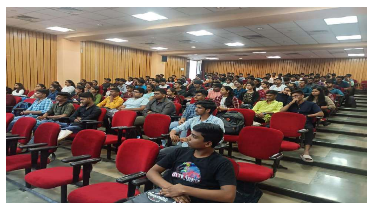
Beneficiary students of F.Y.B.Tech