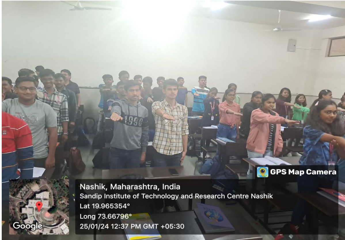
Students Of F.Y.B.Tech taking Pledge on Voters Day