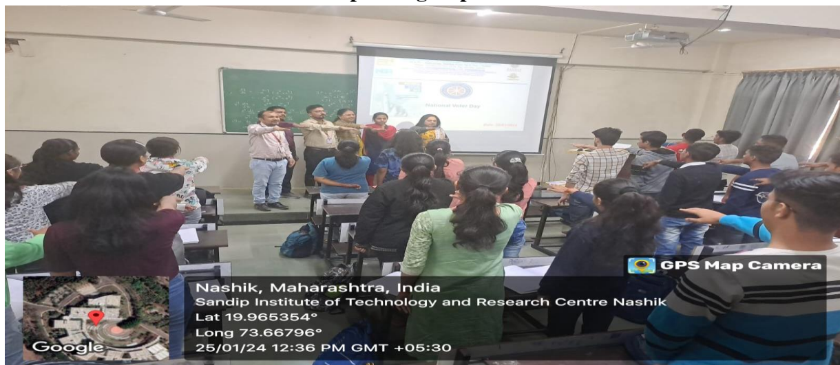
Students Taking Pledge on Voters Day