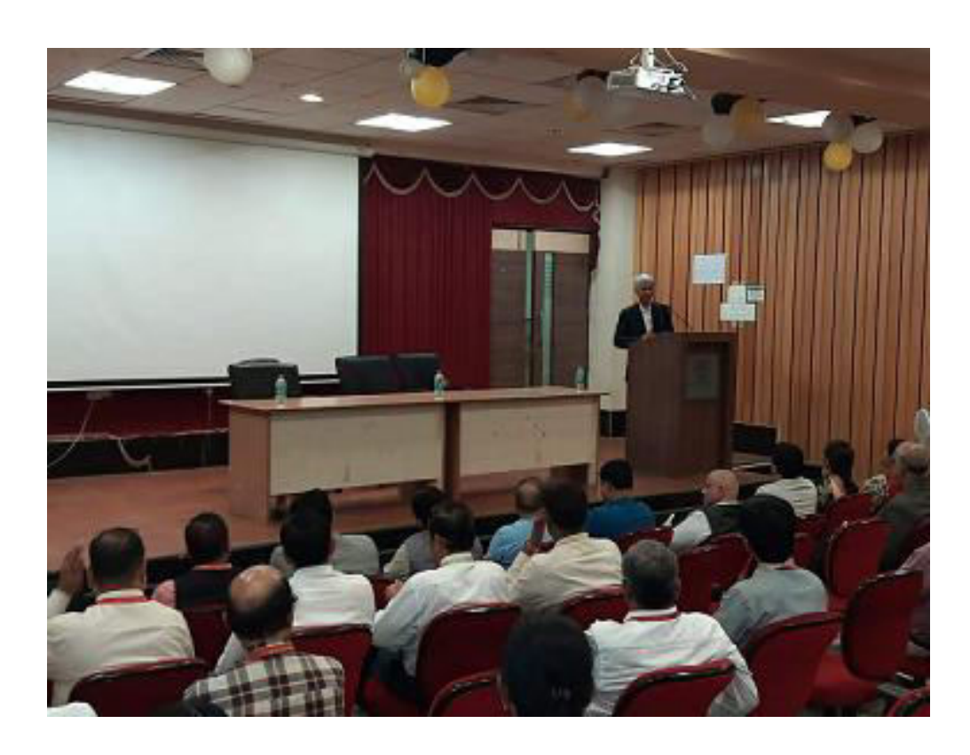
Expert interacting with the faculty members and students