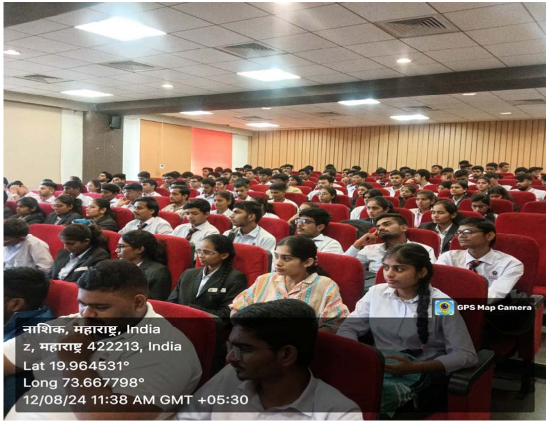
Photo – Students during Python Programming Event