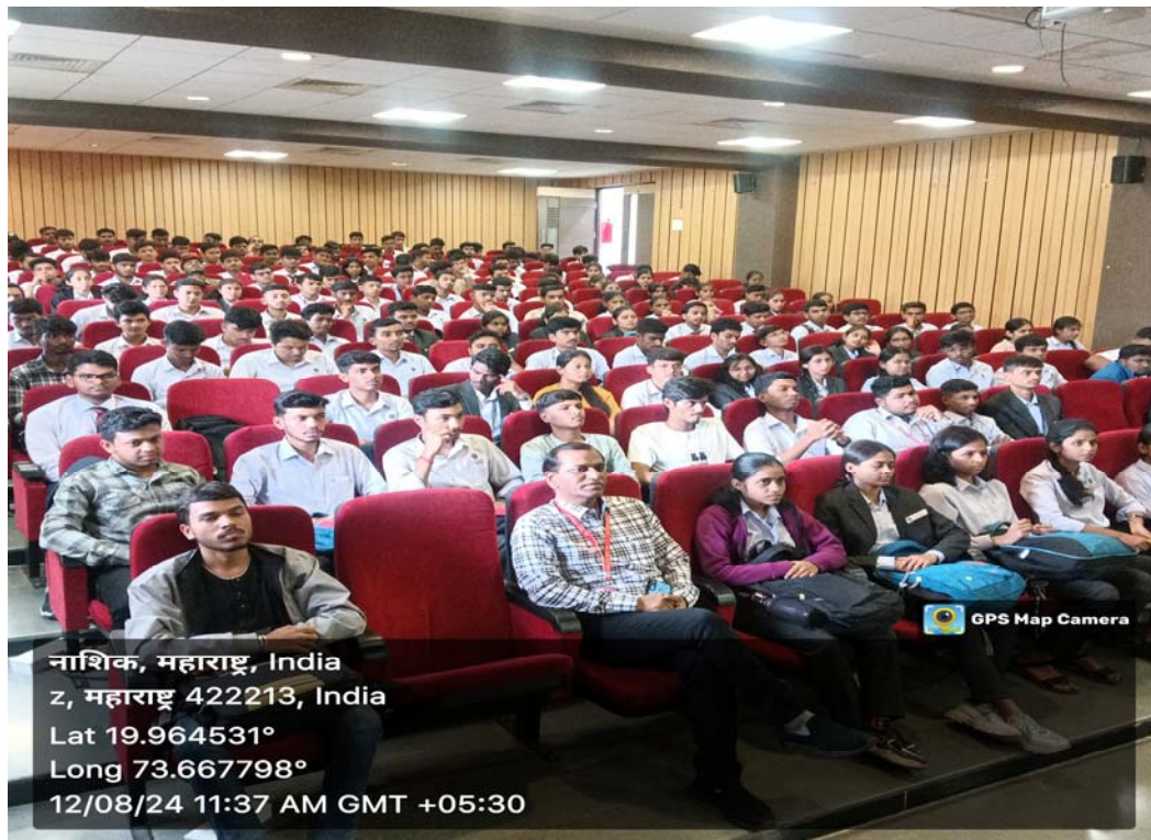
Photo – Students Learning During Python Programming Event