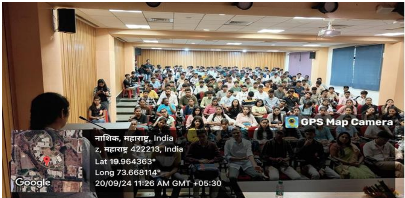
Beneficiary Students of F.Y.B.Tech