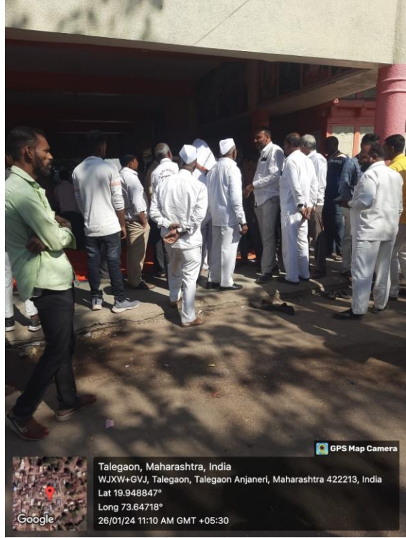
Discussion of village peoples