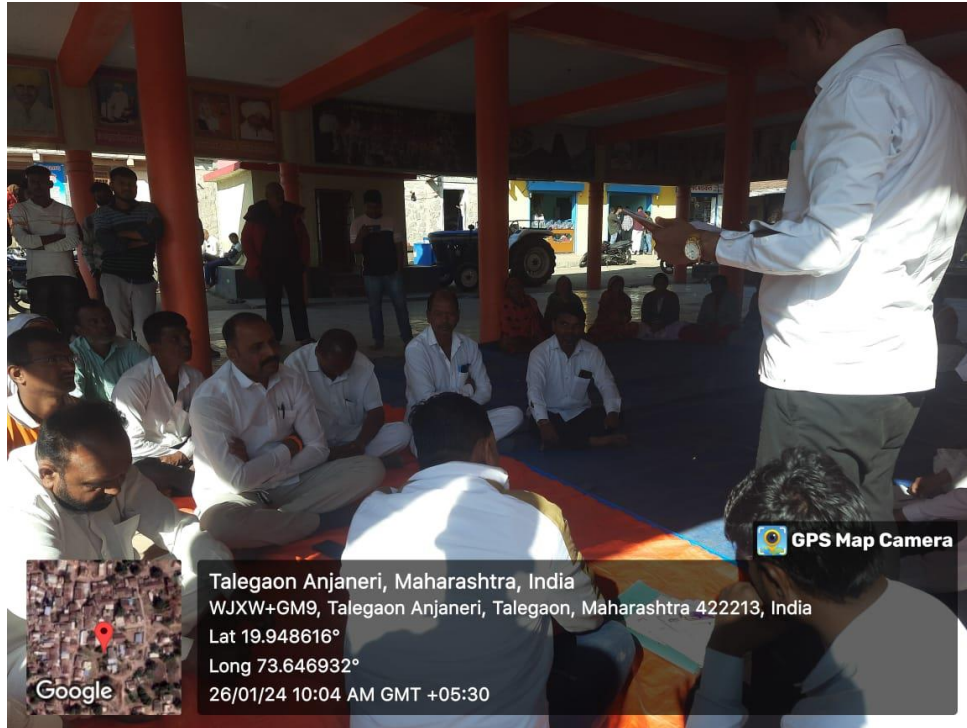
Gram Sevak Reading previous proceeding of gram sabha