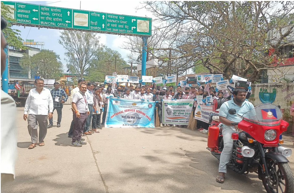
Students with Officers from Trimbak Nagar Parishad