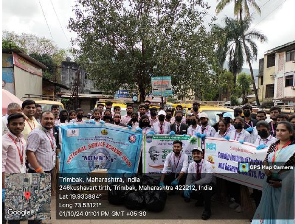
Students and Staff participated in Swchhata Hi Seva Campaign