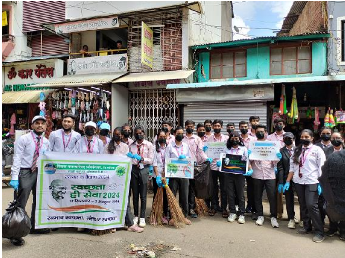
Students participated in Swchhata Hi Seva Campaign