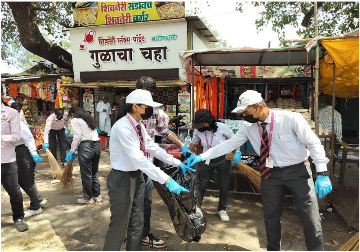
Students doing cleanliness