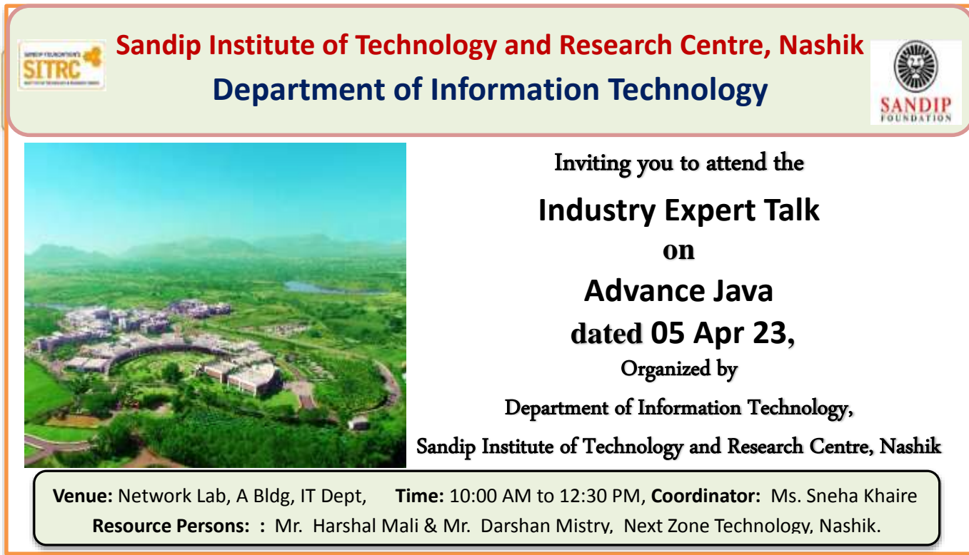
Figure 1 The Expert talk banner