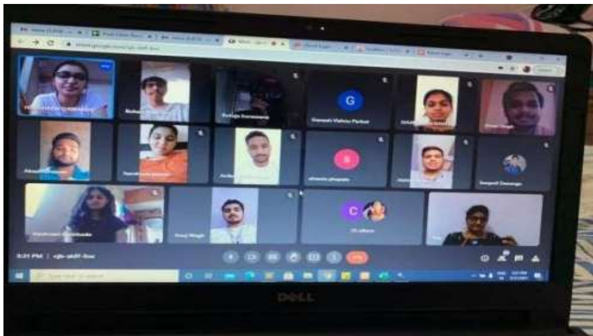
Figure 2 Snapshot of students attending the online session