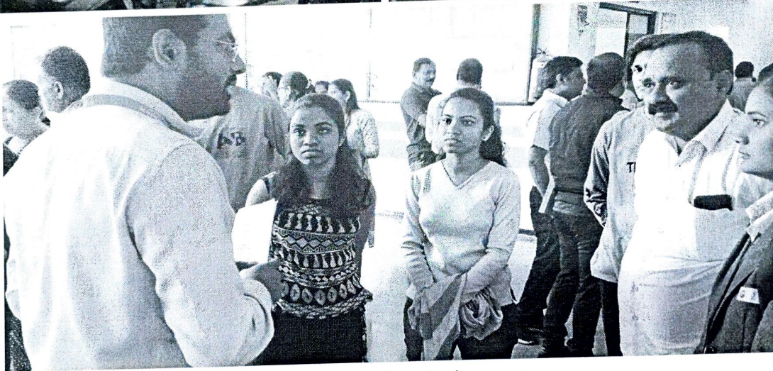
Parents are interacting with teacher regarding their wards academic progress