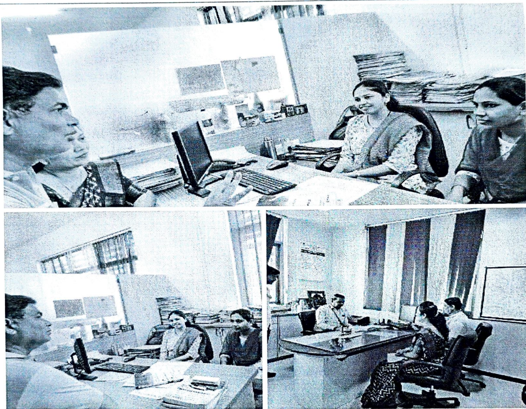
HOD and Faculty members are counselling the parents after tutor meet