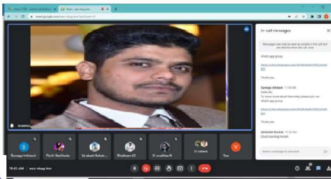
Figure 2 Online session snapshot