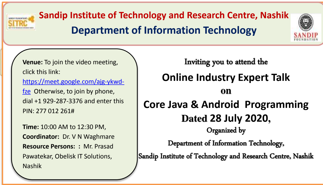
Figure 1 The Expert talk banner