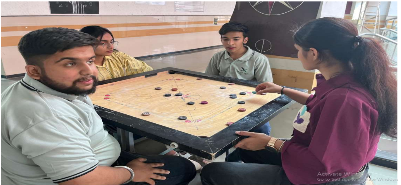
Participants of the compition playing games