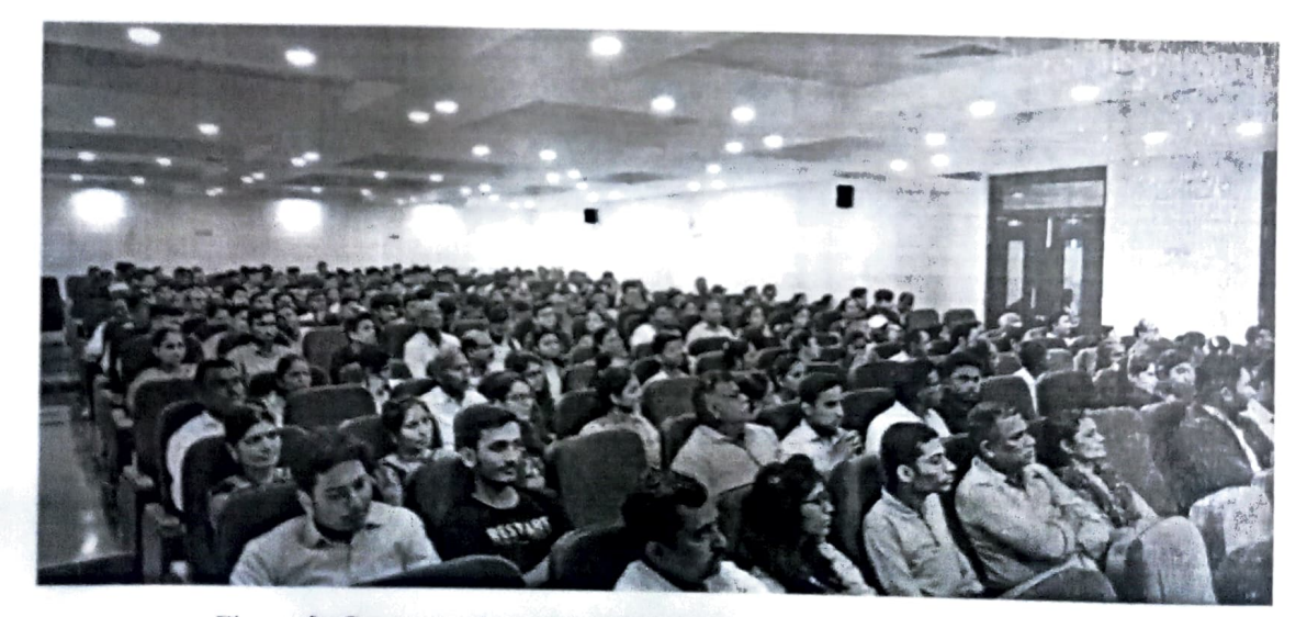
Figure 2: Guest speaker addressing the students and faculty members