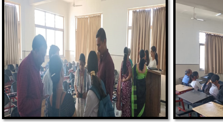
Parents interacting with the class Incharge