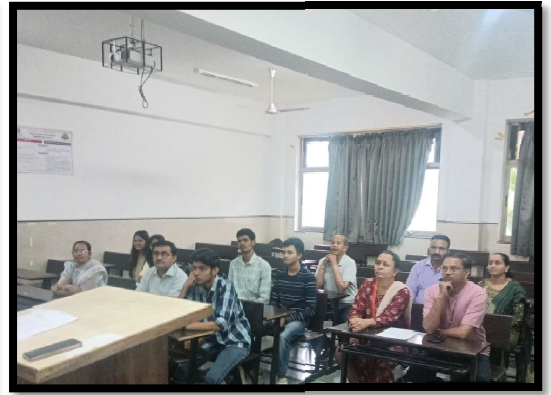
Class Incharge interacting with parents