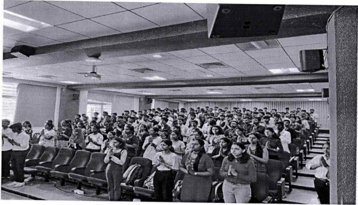
Beneficiary Students of F.Y.B.Tech.